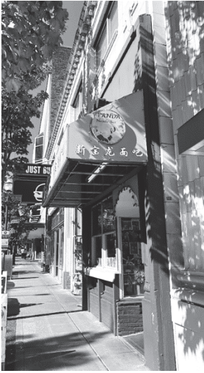
Fig. 5 PANDA Noodle Bar