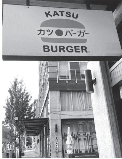
Fig. 6 KATSU BURGER