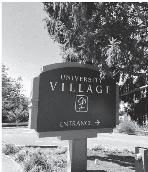
Fig. 3 University Village Entrance