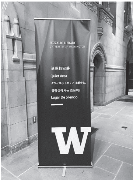
Fig. 7 Quiet Area

The multilingual sign strategy can be observed in another example of multilingual signs, i.e., a temporary standing flaglike signboard at the entrance of Suzzallo Library at the UW. The LL on the UW campus, in general, is similar to that in the U District, with most of the signs being monolingual. Fig. 7 is one of the limited number of multilingual signs on the campus, including five languages, i.e., Chinese, English, Japanese, Korean, and Spanish. Suzzallo Library, the interior decorating and atmosphere of which remind visitors of some Harry Potter movie scenes, has become a popular sightseeing site among many international students in various summer programs at the UW. For example,