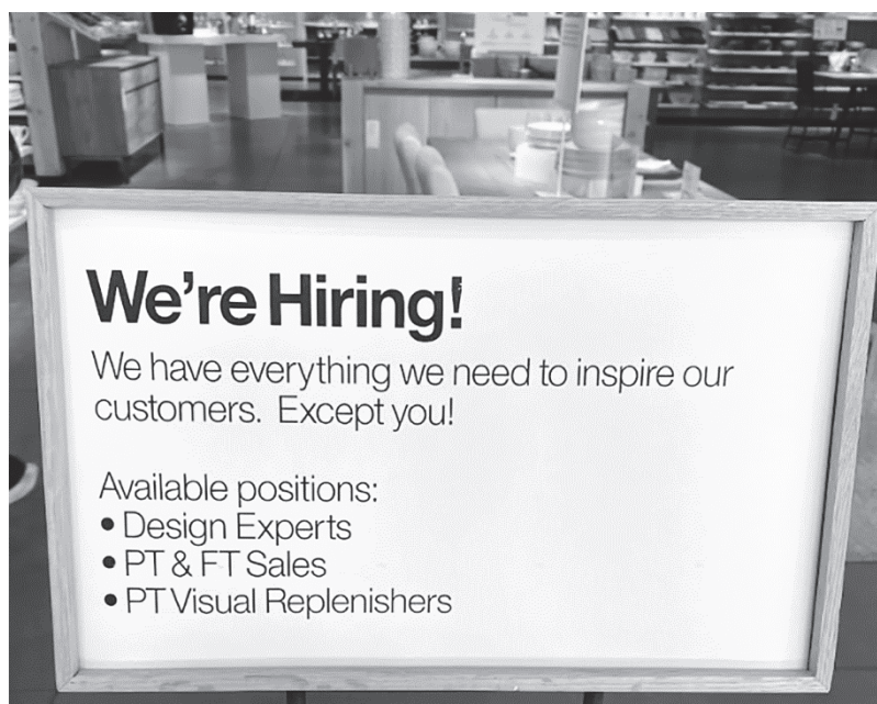
Fig. 8 We're Hiring!

In Brown and Levison's positive politeness (1978, p. 102), Strategy 15 of "giving gifts to H (goods, sympathy, understanding, cooperation)" is applicable to nonofficial signs like Fig. 8 and (8) below. The sign is a message for staff recruitment of a shop in U Village. These "gifts" are further interpreted in this paper as a kind of compliment to the addressees of the sign. After the main message of "We're Hiring!" on the sign, the installer's good mastery of words corresponds to a positive politeness strategy of complimenting the intended addressees. Reading the message on the sign, the potential applicants may feel that they are needed, "liked, admired, cared about, understood" (Brown & Levinson, 1978, p. 129).