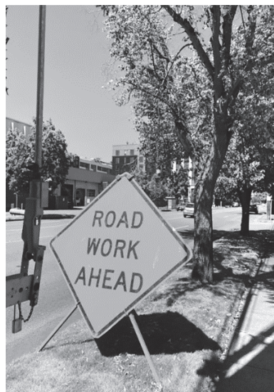
Fig. 4 Road Work Ahead

tourists, the largest common denominator of the languages or potential languages is the English language. Further, it is even more challenging to determine the second widely used language in the community due to the great degree of diversity in race and ethnicity, as discussed above. As a result, monolingual signs are extensively installed in this community, except for restaurants and shops of foreign origin.