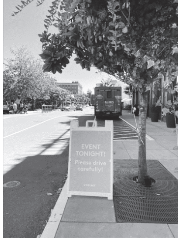
Fig. 2 EVENT TONIGHT! Please drive carefully!